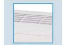
Moving Air Supply grill

The D950E is a medium large size, floor standing or wall mounting condensation dehumidifier, designed for large floor area application. It is a general purpose machine for controlling medium range humidity. It has an good air circulation versus drying capacity ratio. As such no messy duct work is required when this unit is used. Unlike larger models which have very large drying capacity, which require air distribution channels like duct work to convey the dry air from one part of the room to another, the D950 covers good range of floor area. The strong blower circulates the dry air evenly. Therefore, it is ideal for large space dehumidification application. Multiple units are placed at strategic corners of a large space. Installation work is minimal, with no than a simple 230 VAC power supply and common drain pipe