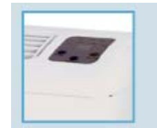
Digital Control Panel with RH display